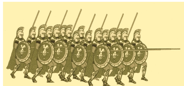
Figure 1: An early cohort in search of favourable outcomes

The defining characteristic of all cohort studies is that they track people forward in time from exposure to outcome. Researchers doing this kind of study must, therefore, go forward in time from the present or go back in time to choose their cohorts (figure 2). Either way, a cohort study moves in the same direction, although gathering data might not. For example, an investigator who wants to study the epidemic of multiple births stemming from assisted reproductive technologies 3 could begin a cohort study now. Women exposed to these technologies and a similar group who conceived naturally